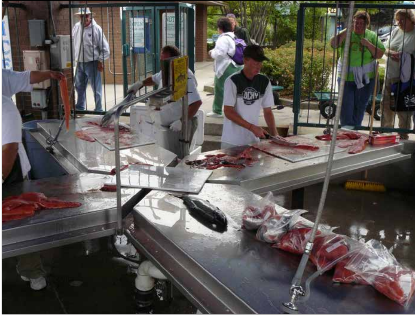
The fish cleaning station at Grand Haven’s Chinook Pier is a testament to the food value of fish harvested under a recreational fishing license.

Recreational anglers in Michigan waters of the Great Lakes harvested fish worth an estimated $67.7 million during 2025, which represents a dramatic increase from the $40.1 million harvested in 2022. Although inflation and the rising retail price of Great Lakes seafood contributed to this rise in value of fish harvested, increased recreational harvest of key species also played a role. According to a new Michigan DNR report, salmon harvest has been increasing in Lake Michigan in recent years, and both Lake Erie and Lake Huron have seen an uptick in walleye harvest since 2022. The recovery of walleye in Saginaw Bay contributed to making walleye the most valuable fish in terms of fillet harvest, with $24.3 million in walleye fillets harvested by recreational anglers in Michigan’s Great Lakes waters