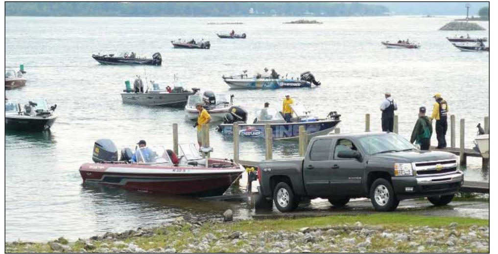
Boats line up to fish a walleye tournament in the St. Mary's River. Events like this highlight the importance of recreational fishing to coastal tourism.