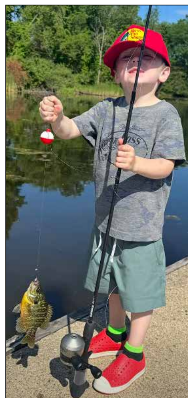
Above left & right: Enjoying the day at Metro West KIDS Fishing Outing Below: Tournament winners view the board!